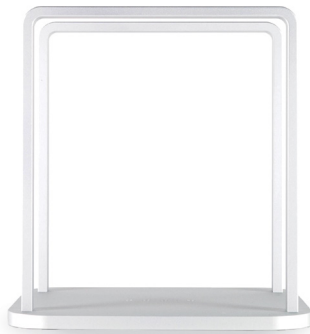
ATLAS EXTRACTION STAND