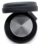
500G CALIBRATION WEIGHT