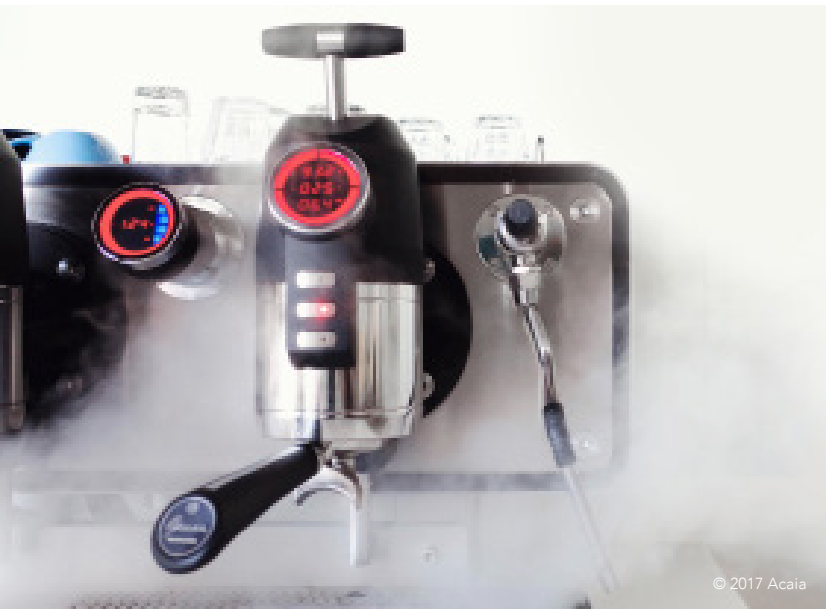
SANREMO OPERA / ACAIA LUNAR DUAL