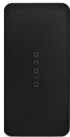
PORTAFILTER WEIGHING PLATE